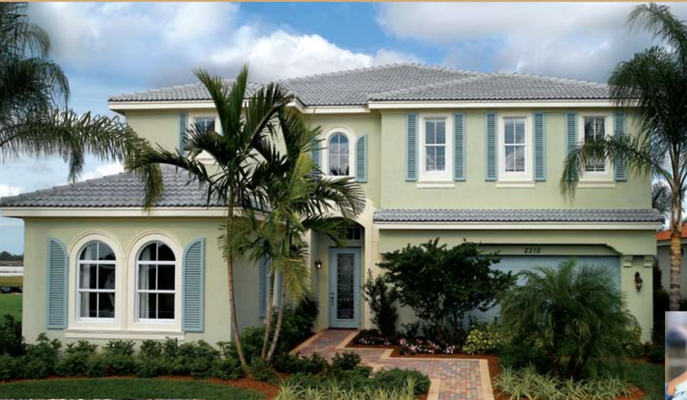
The Murano Model at our PortoSol Community.