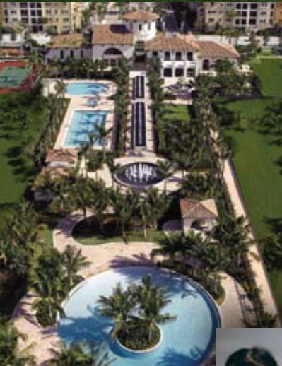
Artesia's $8 million extraordinary clubhouse.